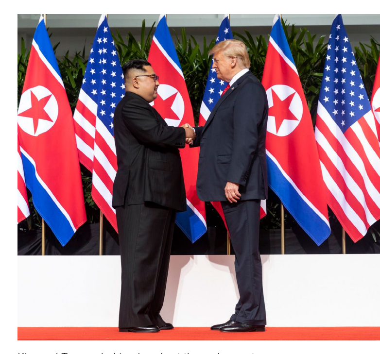
Kim and Trump shaking hands at the red carpet during the DPRK–USA Singapore Summit.

Emotional mediation works through three distinct causal pathways. First, it has the effect of reducing Americans' fear, by humanizing the other.